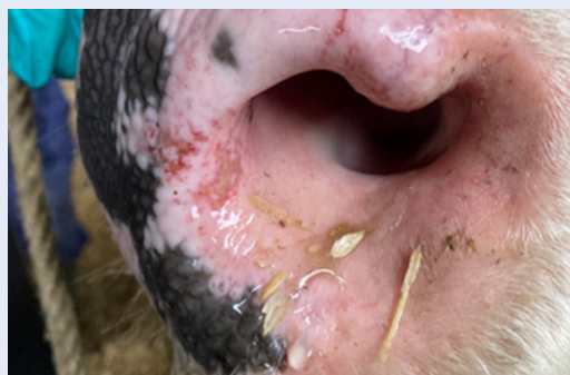
Ulceration in nostrils