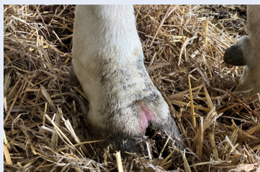
Red interdigital cleft